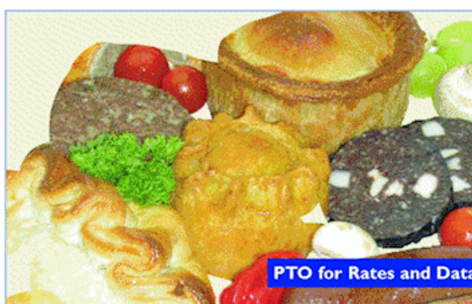
PTO for Rates and Data